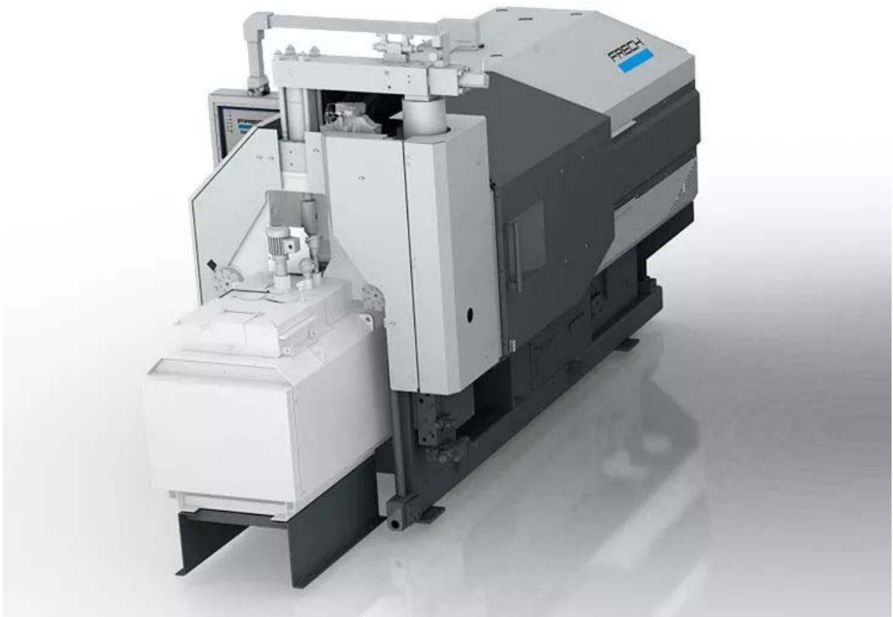
FRECH hot chamber die casting machine